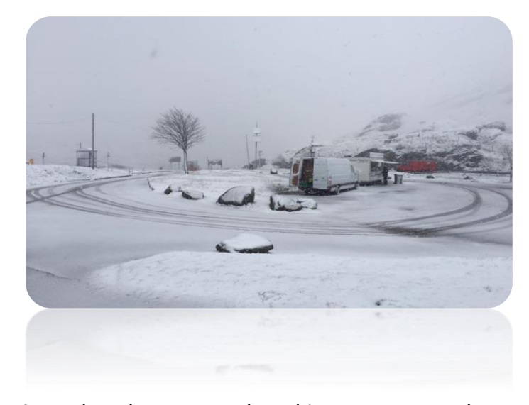
Two days later an isolated burger van at the top of the Rest and be Thankful.