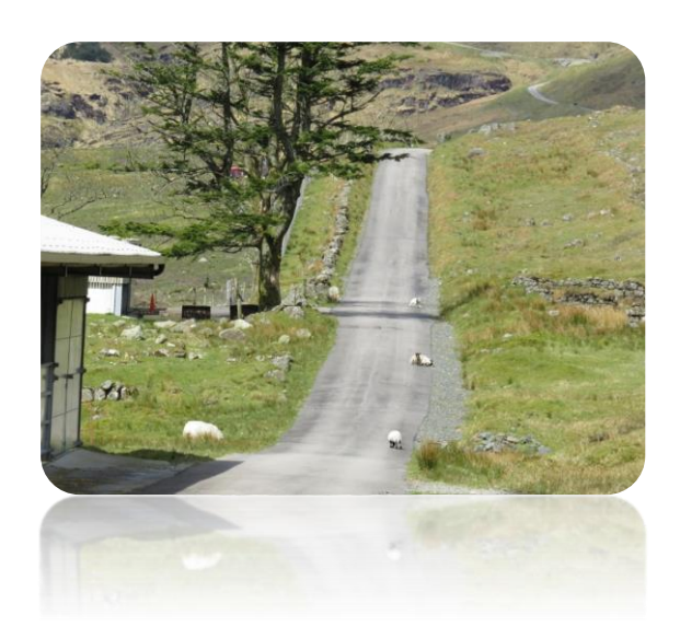
Local residents basking in the sun On Sunday's tour at the start of the Rest and be Thankful.